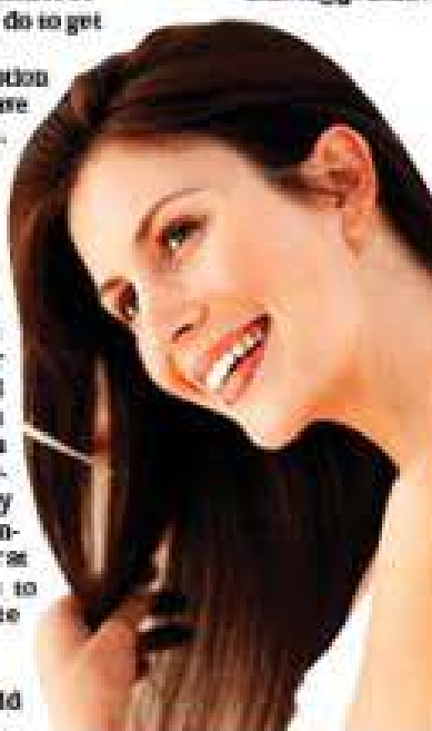
I am a 30-year-old

Sand in queries to beauty. aahra@gnl.com