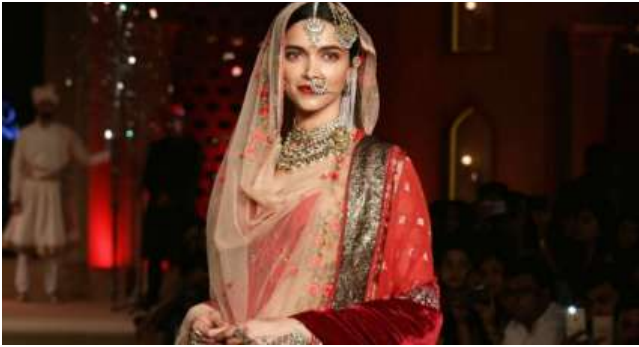
post wedding rituals