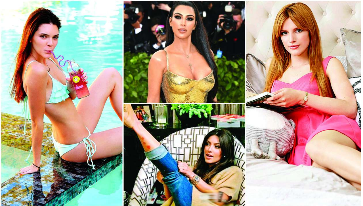
📷 Kendall Jenner, Kim Kardashian, Bella Thorne Kendall Jenner; Kim Kardashian West and (below) the picture that she posted online; Bella Thorne