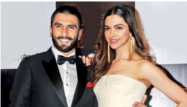
#DeepVeer Wedding: Deepika Padukone-Ranveer Singh to officially share FIRST pics post their marriage at 6 pm today?