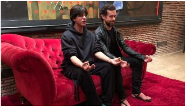
ey in Mumbai! Turns out he was never invited to DeepVeer's wedding